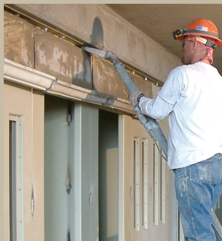
Eliminates onsite panel grouting