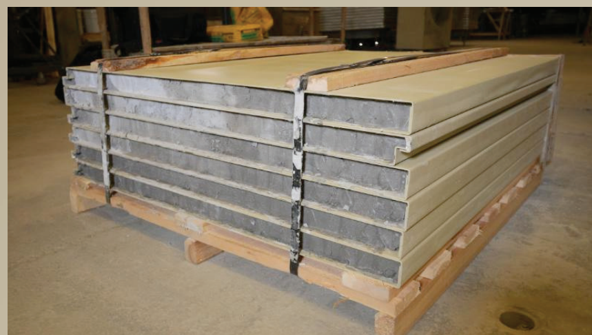
Grout installed at Trussbilt factory, panels ready to ship. Panels are palletized in the order of installation to limit onsite handling.